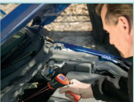
Max hold indicates and holds the peak temperature for easy identification of hot spots