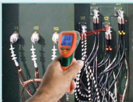
Fast response captures hot spots