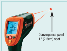
Two laser points converge at a distance of 50"/(127cm) and form a 1" (2.5cm) spot.